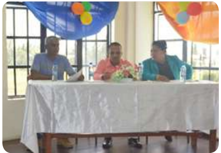
Special invitees at the Head Table