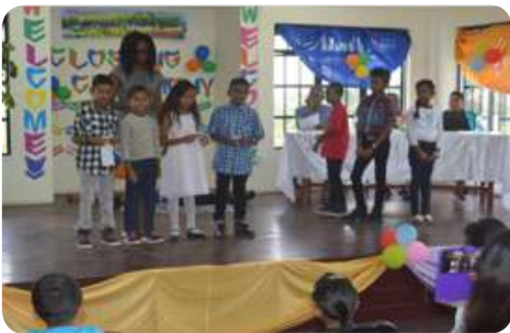
Students performing an item