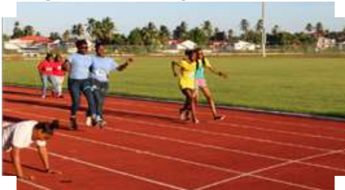
Staff participation in a novelty race.

History was made on March 24, 2017 when the Faculty of Education and Humanities won the University of Guyana Annual Sports Day. This was the first time that the Faculty has ever won the competition. The FEH comprises two former faculties –