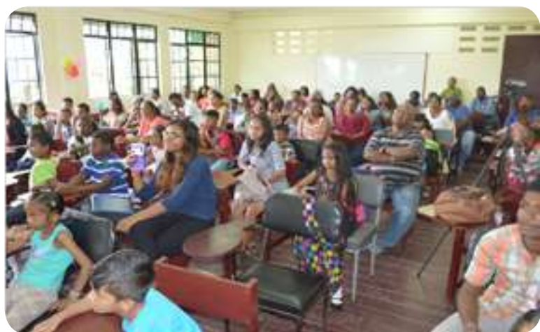
Section of the audience