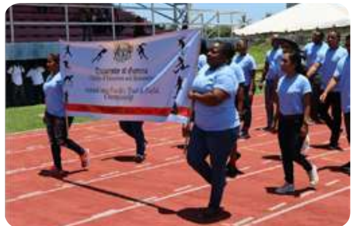
Faculty of Education & Humanities Contingent at the March Past.

Special tokens of appreciation and certificates were presented to the athletes.