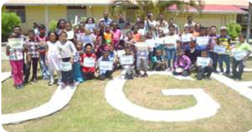
Group photo of volunteers and students

With corporate support, the University of Guyana Berbice Campus Library (UGBCL) held its 13th Annual Reading Programme during July 10– 28, 2017. The programme catered for approximately sixty two (62) students at the grade five (remedial level). The students were mainly from Cropper Primary School, the Berbice Islamic School and the Bal Nivas Shelter.