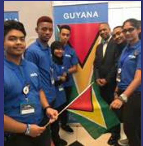
Left: Team Guyana Robotics Team