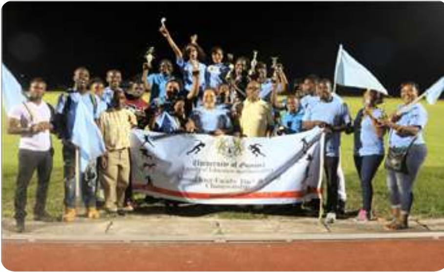
The Winning Team after the event.

History was made on March 24, 2017 when the Faculty of Education and Humanities won the University of Guyana Annual Sports Day. This was the first time that the Faculty has ever won the competition. The FEH comprises two former faculties –