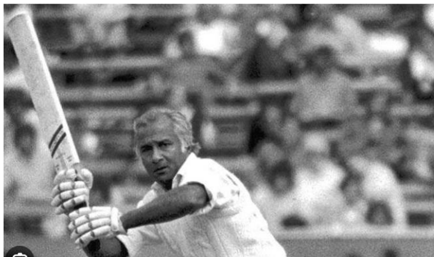
Legendary Test Cricketer Rohan Kanhai