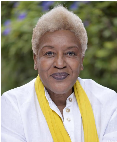
Award-winning Actress CCH Pounder

Baroness Amos is the first person of colour to be appointed as a Companion (Knight or Lady) to the Garter. (Haile Selassie I, the late Emperor of Ethiopia, was a royal member of the Order) and was installed in June 2022. The Order of the Garter is the oldest and most senior Order of Chivalry in Britain, established by King Edward III nearly 700 years ago. The Order includes The King, who is Sovereign of the Garter, several senior Members of the Royal Family, and twenty-four Knights or Ladies chosen in recognition of their work. Baroness Amos will be conferred with the prestigious Honorary Doctor of Laws and will address the graduation on November 10 th at 10 AM at the University's 3 rd graduation ceremony.