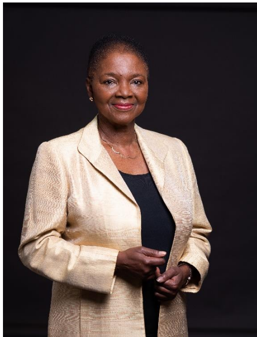
Baroness Valerie Amos