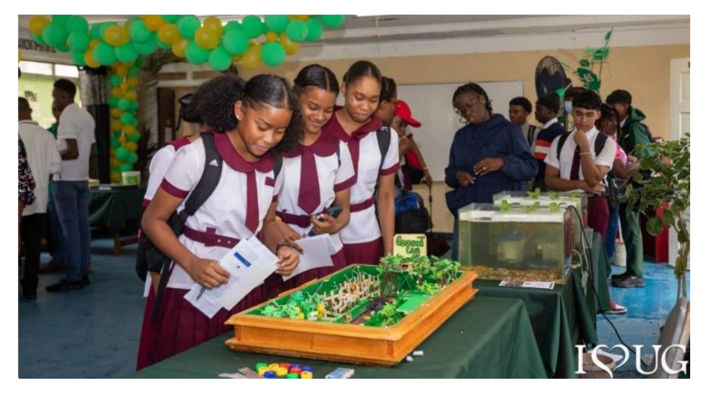
Secondary school students at one of the booths at UG 2023 Open Day and Job Fair